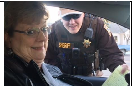
Meeting of Choteau's finest...do not reverse over a double yellow line on Main Street. Thankfully, this smiling officer issued only a warning.